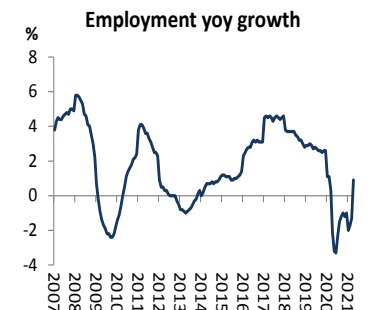
Figure 2: Average employment (y/y growth)