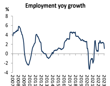
Figure 2. Average employment (y/y growth)